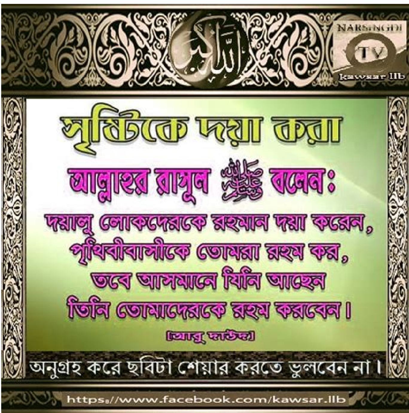
App for islamic books. Best bangla islamic book list. Bangla islamic book apps pdf. Best islamic book in bangla.